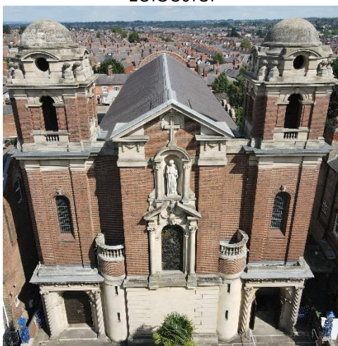
The Church of St James the Greater Leicester