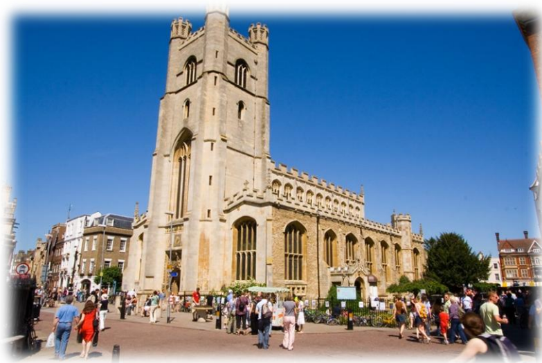
Great St. Mary's Church, Cambridge

A day trip to Cambridge is being organised on Saturday 1 st August . This is in conjunction with St James Choir singing Choral Evensong at Great St Mary's Church on that day. At this stage, likely numbers are needed so if you are interested, please sign the form at the back of church. Please think of joining us for this fellowship together.