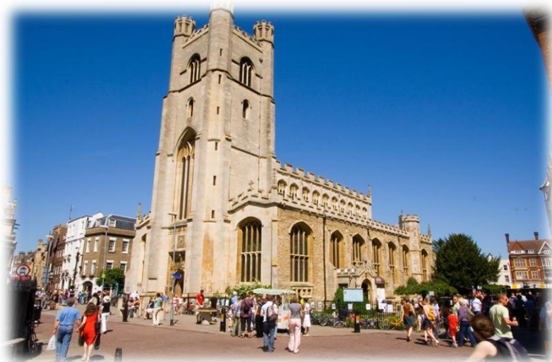
Great St. Mary's Church, Cambridge

A day trip to Cambridge is being organised on Saturday 1 st August . This is in conjunction with St James Choir singing Choral Evensong at Great St Mary's Church on that day. At this stage, likely numbers are needed so if you are interested, please sign the form at the back of church. Please think of joining us for this fellowship together. More information to come.